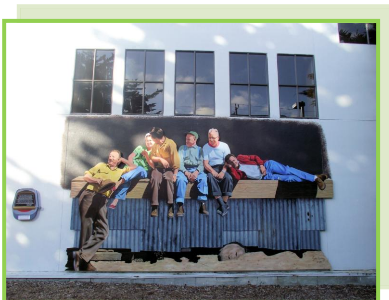
Cannery Row Mural